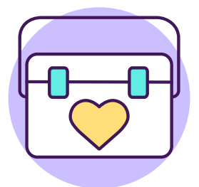
Household Emergency Packs for distribution in an emergency

When starting their resilience journey individuals, households, families and groups often feel overwhelmed. There can be many challenges and difficulties. In Aberdeenshire we have begun work to simplify the approach to resilience by producing a suite of documents that make it easy to develop resilience arrangements at any level. In addition to accessing information, we will instigate the following: