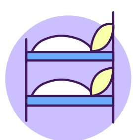
Review our approach to the provision of council Rest Centres