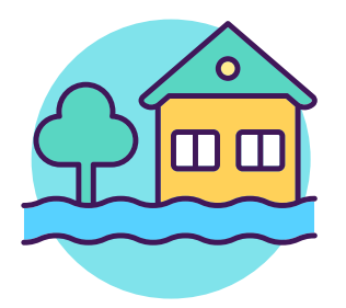
Flood Prevention Workshops