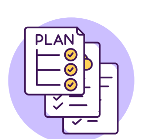
Develop a series of guidance documents to help Community Groups set themselves up to be Resilient