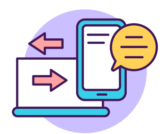
Develop Technical Communications Solutions