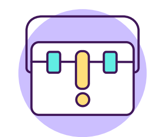
Community Resilience Packs for use by Council and Community Responders