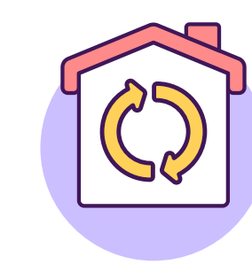
Explore a Facilities Improvement Project to improve resilience infrastructure across Aberdeenshire